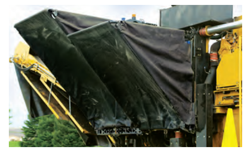
AIR INTAKE. The cooling package air intake chutes are located high on the machine to provide more clean air and less dirt-contaminated air from near the ground.

COOLING AND FILTRATION SYSTEM. The cooling and filtration system is specially designed to reduce the amount of dust that is pulled into the cooling package. Wide fin spacing and filters are designed to reduce the buildup of dust and tar on the cooler surfaces, and swing-out doors allow for easy ground level access for cleaning and filter replacement.