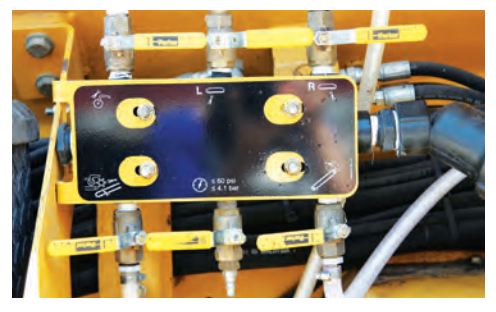
WATER APPLICATION SYSTEM. Adding water during the grinding process helps to extend the life of the cutters and other wear surfaces, and reduces the amount of dust and shingle residue on the machine components.